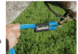
Choice of colors with name