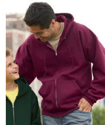
Personalized Zip/Hood Sweatshirt Item # 993M choice of colors

Choose 1 of the following items: Front Zip Hoodie Pullover Hoodie Polo Shirt Long Sleeve T-Shirt