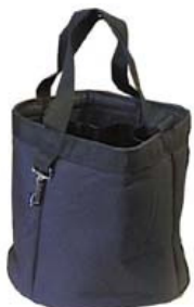
Supply Bag MiCMO Logo Black, Blue, or Red

(options for those who have already won a jacket) (If you want a second jacket, you may purchase the jacket and NACMO will embroider it)