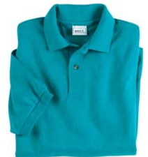
Personalized Polo Shirt Item # J100 choice of colors