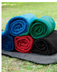
Personalized Fleece Blanket Choice of Color